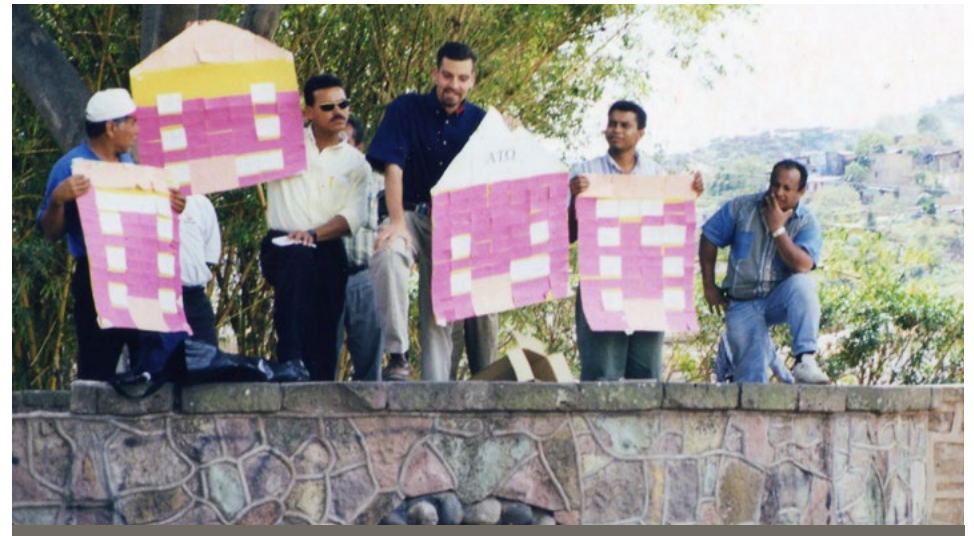
Meeting with the Hurricane Mitch survivors in Parque Concordia in downtown Tegucigalpa. February 28, 1999.

I was standing on a battered retaining wall in an urban park that had been destroyed by Hurricane Mitch just weeks before. The hundreds of eyes looking back at me belonged to survivors who had lost their homes in that same storm. The river that flowed just a hundred feet or so from this park is the same one that raged into their neighborhood on the night of October 31, 1998. It took everything they owned.