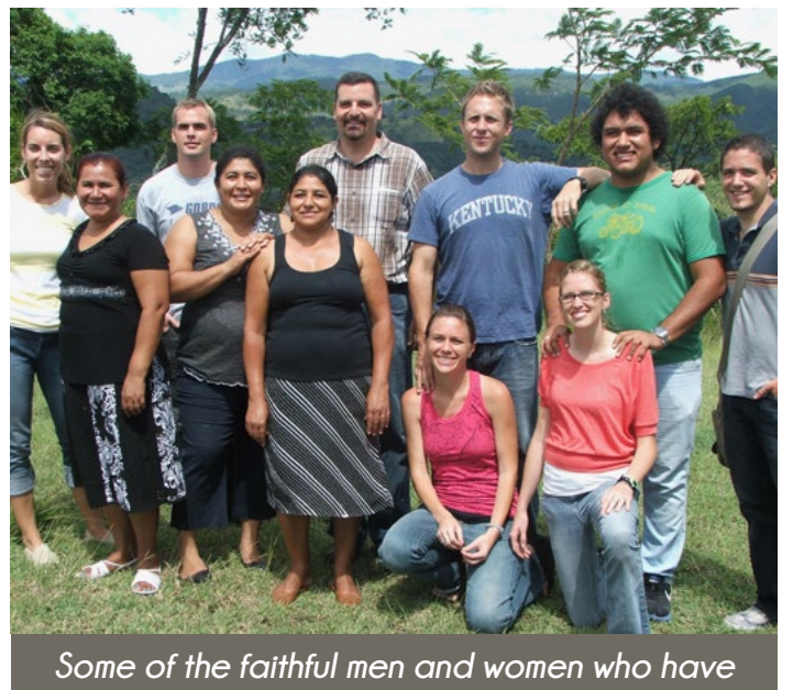
served with the Micah Project over the years.

I am grateful for my broken heart. It sounds strange to admit, but it's true. It is my most cherished gift after 25 years of ministry in Honduras. It reminds me every day to wait with eager expectation for RESURRECTION. It reminds me to love the kids that God brings into the Micah Project in their entirety, even their broken parts. It reminds me that God did not choose me because of any strength I might have, but because He loves me enough to remind me that His strength is perfect in my weakness.